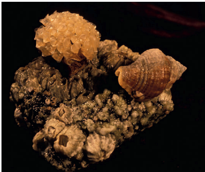
Figure 1 Male (left) and female (right) Solenosteira macrospira . The male's shell is completely covered with egg capsules.

istic of other gastropods that lack male parental care. We also characterised temporal variation in patterns of paternity by comparing parentage across broods in different stages of development. Our results show that exclusive and costly male parental care occurs despite considerable female promiscuity and very limited paternity within cared-for broods.